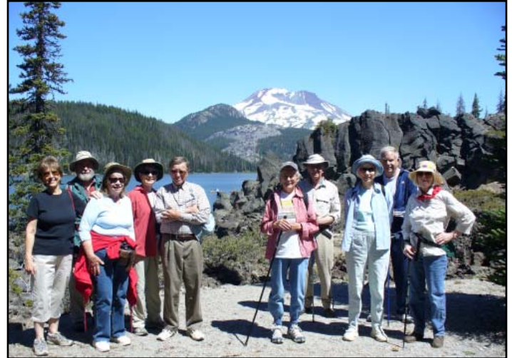
The Hearty Walkers take a break during a recent hike to Sparks Lake.