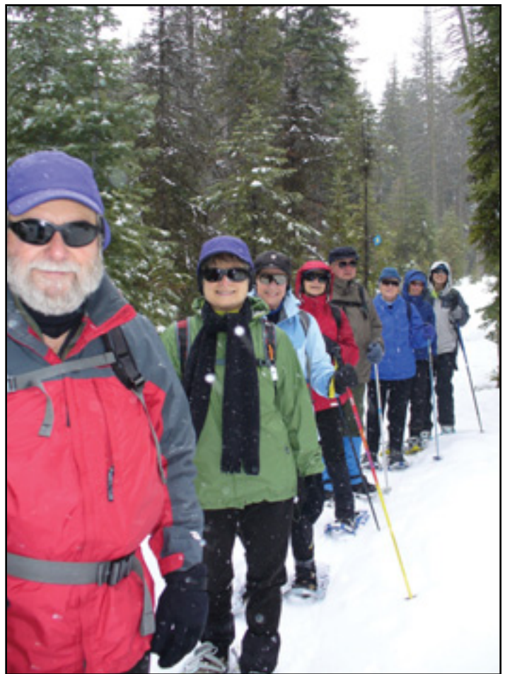
Touchmark residents take advantage of the year-round recreational activities that surround them in Central Oregon. This group of snowshoe enthusiasts enjoys an outing at Virginia Meissner Sno-Park.