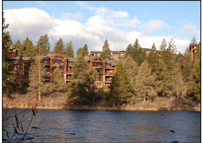
A 1,367-square-foot lodge home is currently available in the River Lodge (pictured). The home features two bedrooms, two bathrooms, a magnificent view of the river, easy river access, private deck, and gas fireplace.

Do you envision sharing this summer’s celebrations with friends? Visit Touchmark today to learn more about this vibrant community or call 541-383-1414 to learn more about the summer’s featured homes. ■