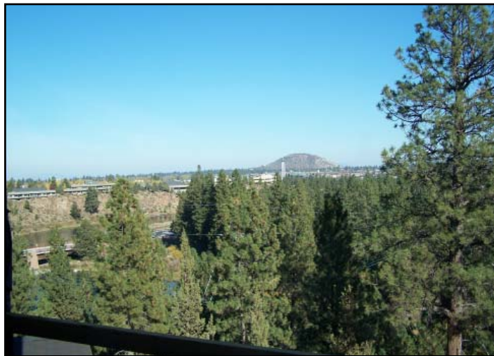
This spectacular penthouse features lovely views of the river and canyon (pictured). Located in the Cliff Lodge, this home offers 1,825 square feet, two bedrooms, two bathrooms, vaulted ceilings, a den, a utility room with sink, excellent finishes, and clean steel appliances.