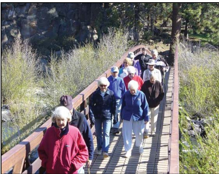
During a sunny spring day, the Hearty Walkers cross a bridge in Sawyer Park.