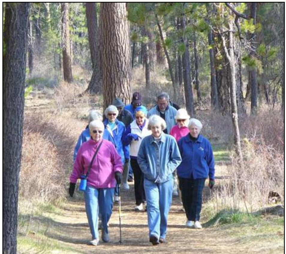
The Hearty Walkers hike through Shevlin Park.

People can take in picturesque views, spend time with friends, and enjoy the benefits of walking. (cont.)