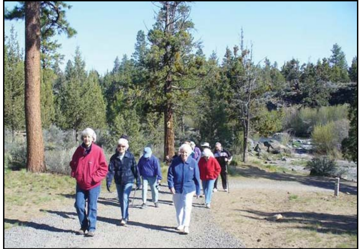
The Hearty Walkers stride through Sawyer Park.