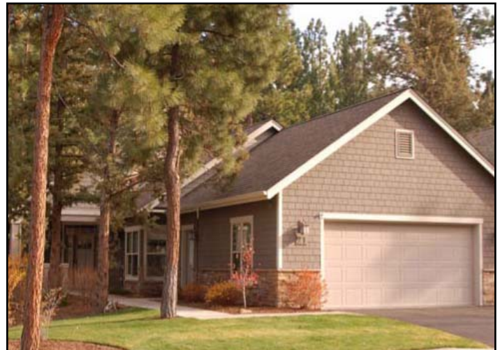
This cottage includes air conditioning, alder cabinetry, vaulted ceilings in great room, and fully landscaped yard.

This 1,600-square-foot Adams floor plan offers a lovely view of the nearby river. The home includes a 607-square-foot garage, two bedrooms, two bathrooms, and a deck. Touchmark provides inside and outside home maintenance, and the home is close to Touchmark's River Lodge.