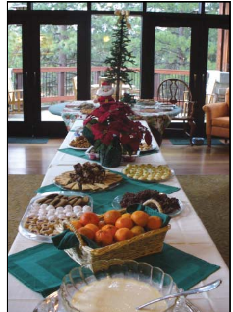
More than 25 types of cookies lined the table at the annual Ladies' Cookie Exchange. The women exchanged the home-baked treats while enjoying each others' company.