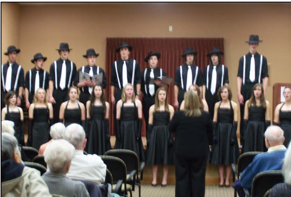
Summit High School's Skyliner Jazz Choir performed in the Forum, singing a variety of Christmas and holiday tunes that touched hearts.