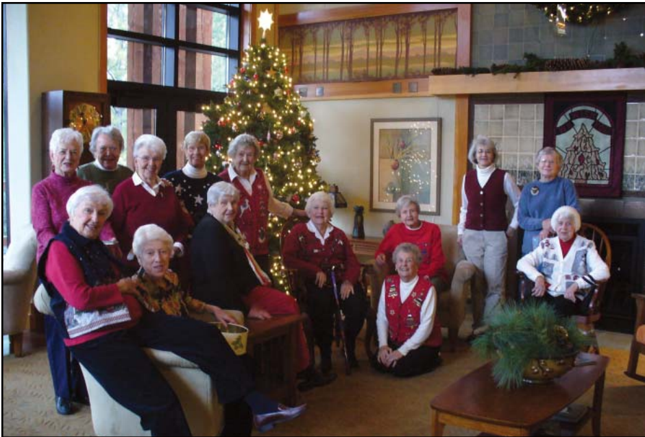
Touchmark women dressed for the season at the cookie exchange, which was held in the River Lodge Great Room.