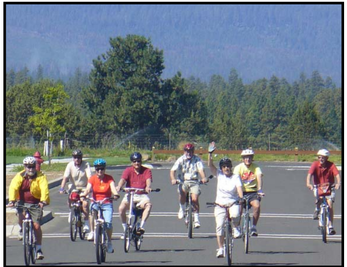
The Touchmark bicyclists enjoy Central Oregon's picturesque beauty.