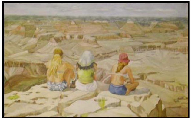
The AARP Foundation selected this painting created by Touchmark resident Hilary Kenyon for its 2008 calendar.

Hilary leaves this month for an Adventure Travel vacation in South Africa—and will most certainly return with numerous pictures for future paintings.