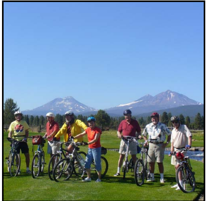
The group pauses for a photo with the Three Sisters rising behind them.