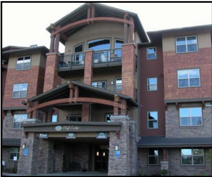
The North Wing of the Cliff Lodge is officially open. Come tour these spectacular lodge homes. Call 888-231-1113 or 541-383-1414 today.

This month’s e-mail drawing winner is a couple from Tucson, Arizona, who are looking to get out of the heat.