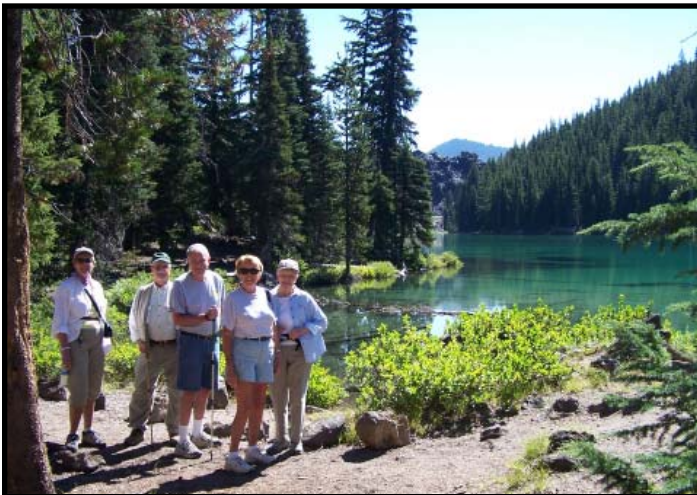
“We did it.” Taking a breather after hiking the Ray Atkeson Memorial Trail at Sparks Lake.