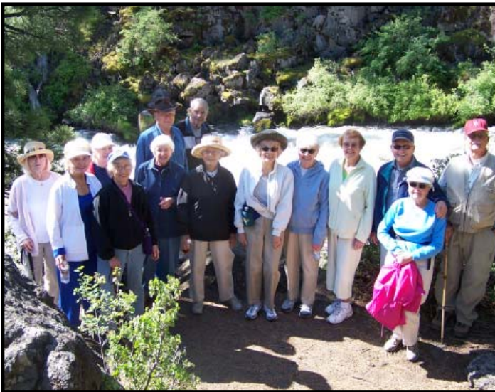
Hearty Walkers enjoy Dillon Falls upstream on the Deschutes River during their weekly Friday walk.